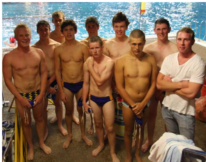
The Open Water Polo Squad

Trials for the Under 15's are just about complete and an announcement of the team selection will be made early in Term 2, with their competition commencing Monday 4 th May.