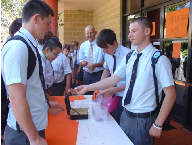
Solidarity boys promoting Harmony Day

saying no to racism, promoting peace and living in harmony in a multicultural world.