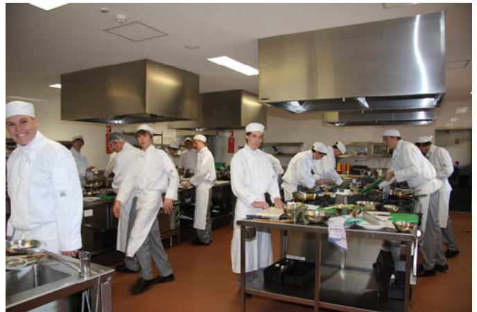
Hospitality students at work

Mothers, be sure to put this event in your diary for next year!