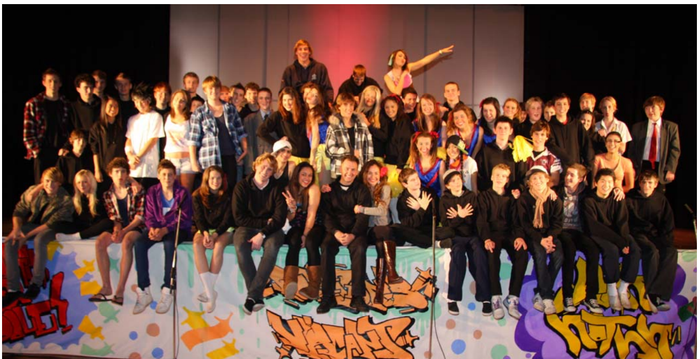
Cast and Crew of "Positions Vacant"