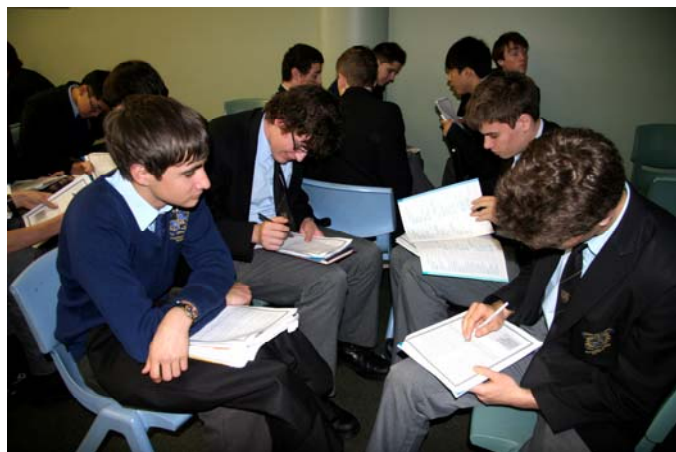
Year 12's doing some group work with in the "5 Steps to HSC Success" session.