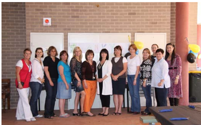
Year 12 mothers who helped to prepare and serve the lunch to the teachers and students last Friday.