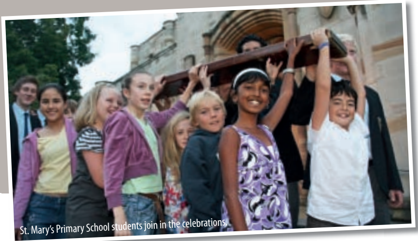
St. Mary's Primary School students join in the celebrations